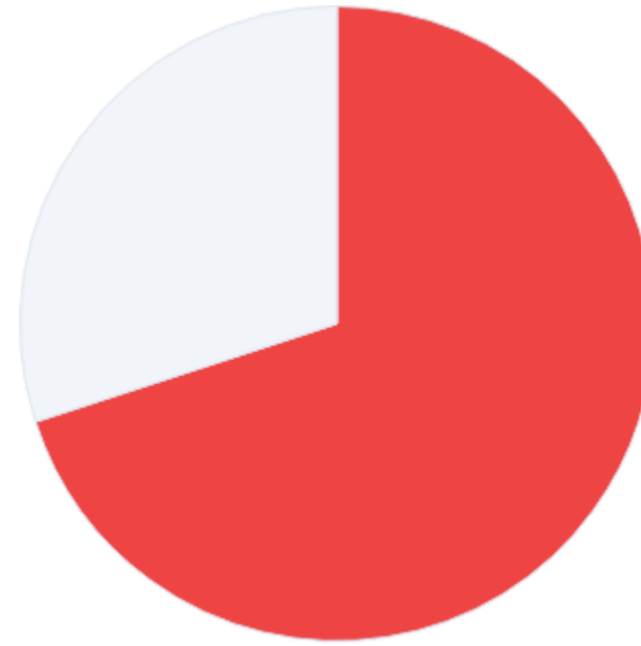
TARGET DEMOGRAPHICS (2023-2024)

● Small to Mid-Sized Biz (SMBs) ● Large Enterprise